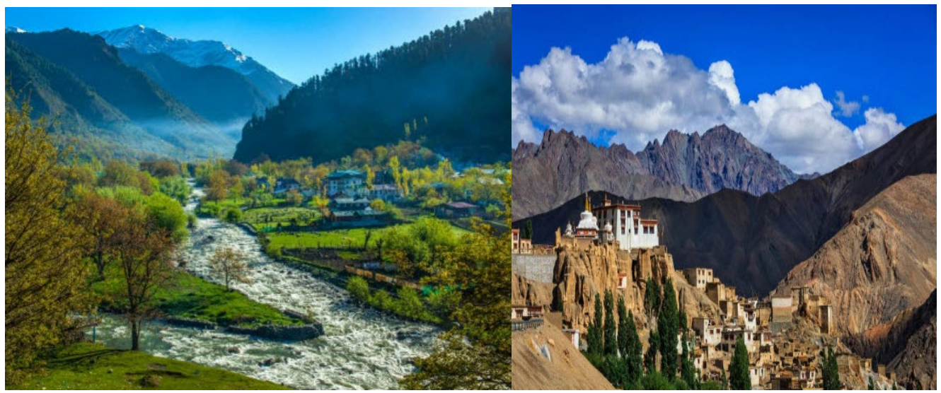
The different landscapes of Ladakh & Kashmir

IMPORTANT NOTICE: This is meant to be a "free and easy" adventure trip. Participants should be relatively fit, with a good sense of humor, and above all, have the right attitude for close travel with others through possibly some trying times. Most definitely, this is not a trip for prudes, whiners, fuss-pots, and other similarly assorted types! We had a couple of those before and it wasn't pleasant for us or them. Although every effort will be made to stick to the given itinerary, ground conditions may change and cause some disruption and/or deviation from the norm. Otherwise, have fun.