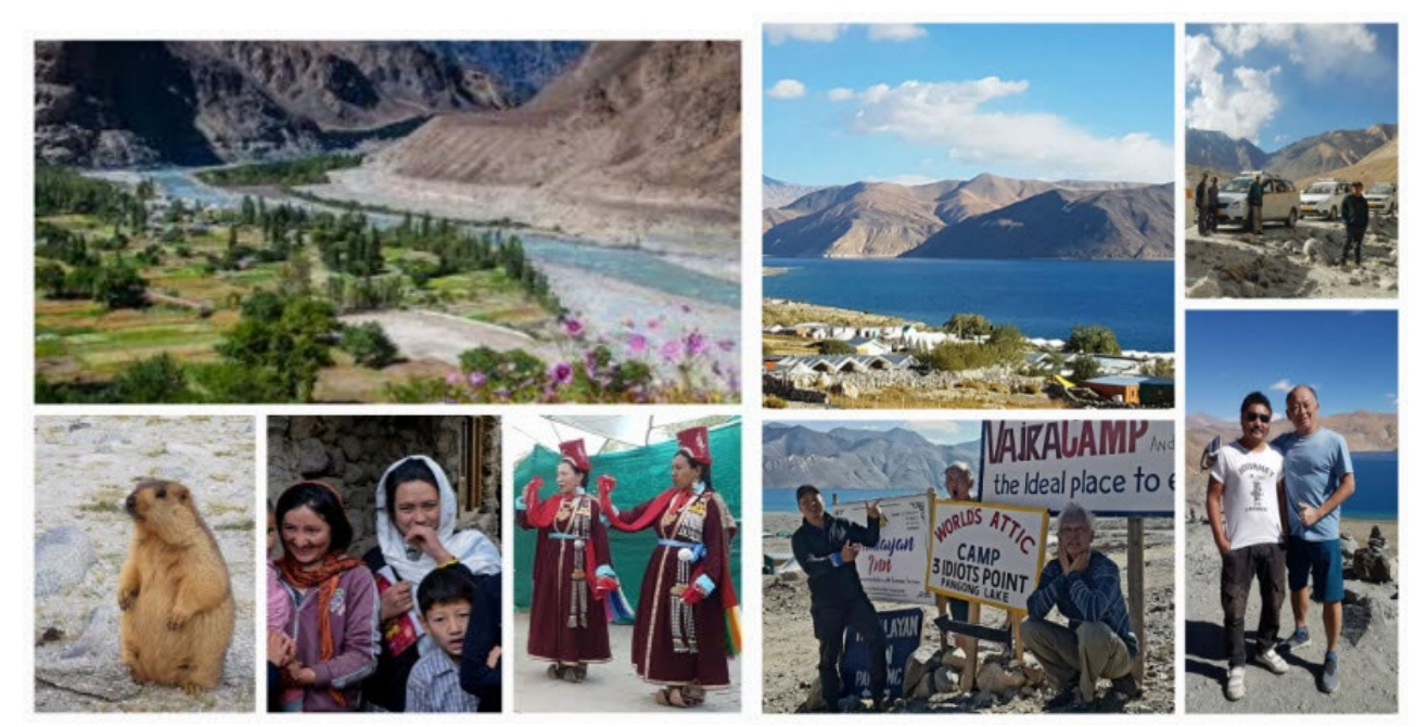
Turtuk Village/Pangong Lake

DAY 8 NUBRA DAY EXCURSION TO TURTUK VILLAGE (80 KMS) Post breakfast proceed for day excursion to Turtuk, a small village that lies on the banks of the Shyok River in the Nubra valley region and consists predominantly of Muslim population. The village is a gateway to the Siachen Glacier and consists on the line of control to the Pakistan occupied Kashmir. The place has vast greenery and serene beauty and is a hidden gem due to its spectacular flora including a wide number of apricot trees. The place has recently opened up for tourists and is still unexplored. This is the northernmost village of the country that had long been a part of Pakistan till India reclaimed it in the 1971 war. Thus, this is the last village up the region where tourists are allowed from 2009 and that adds to the fun of visiting this place. Turtuk has some great places to explore like the 16th century Minarets and Mosques, the Royal House of the Yabgo dynasty, the ruins of Pun Khar, K2 Peak's view, and the villages that can be explored through camping and cultural tours. The place is highly worth a visit because it is a place that continues to follow the Balti culture of Pakistan and the place has extremely warm and hospitable Muslim locals who would make you feel at home there. Later drive back to Nubra. Overnight Nubra Valley (B,D)