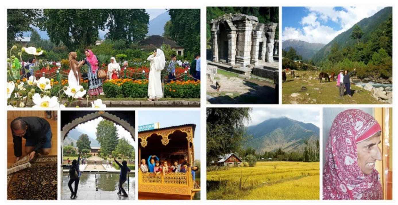
Srinagar Boat House/Sonmarg

DAY 3 SRINAGAR-DOODHE-PATHER-SONMARG Post breakfast day excursion to Doodh-e-pathri, a bowl-shaped valley about 42 kms form Srinagar. It is a recent discovery in the valley covered with the green carpeted small meadow set in the heart of mountains to the south-west of Srinagar. It is an ideal picnic spot can be visited from here. We will take you to acres upon acres of grassy meadow ringed by forests of pine, and towering beyond them, awesome and majestic snow-clad mountains. A flowing river resounds with soft wind passing through the pine trees of the enclosures of the valley. It is also called as a "VALLEY OF MILK". It is said that the cattle grazing in the meadows of Doode e Pather, produces rich milk in large quantity. After own lunch, we continue the journey to Sonmarg. Free and easy evening.. Overnight Sonmarg(B,D)